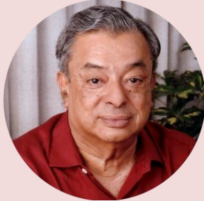
Dr Verghese Kurien

A quarterly magazine of Anandalaya Oct – Dec, 2017 : Issue - 2